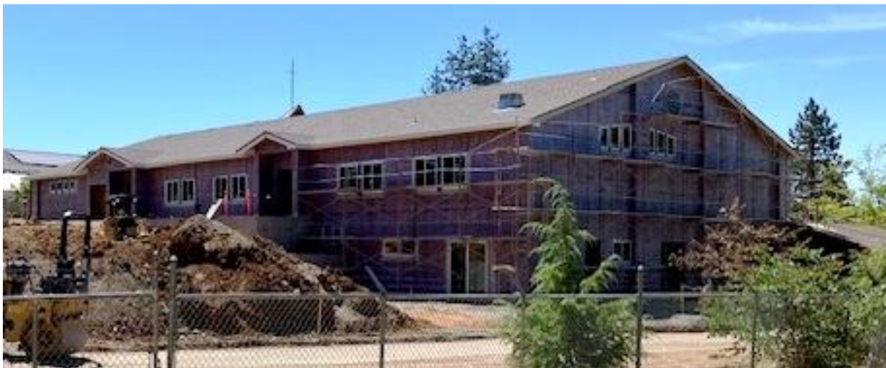
July 15, 2024: Front, east side, back and west sides: