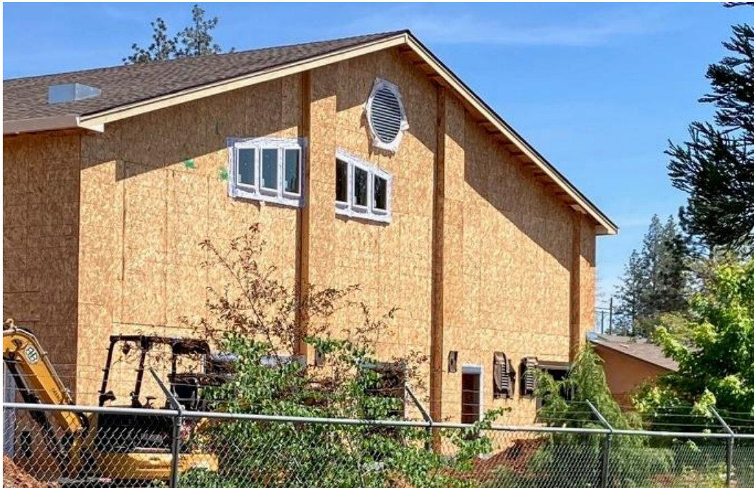
June 17, 2024: Front, east side, back and west sides: